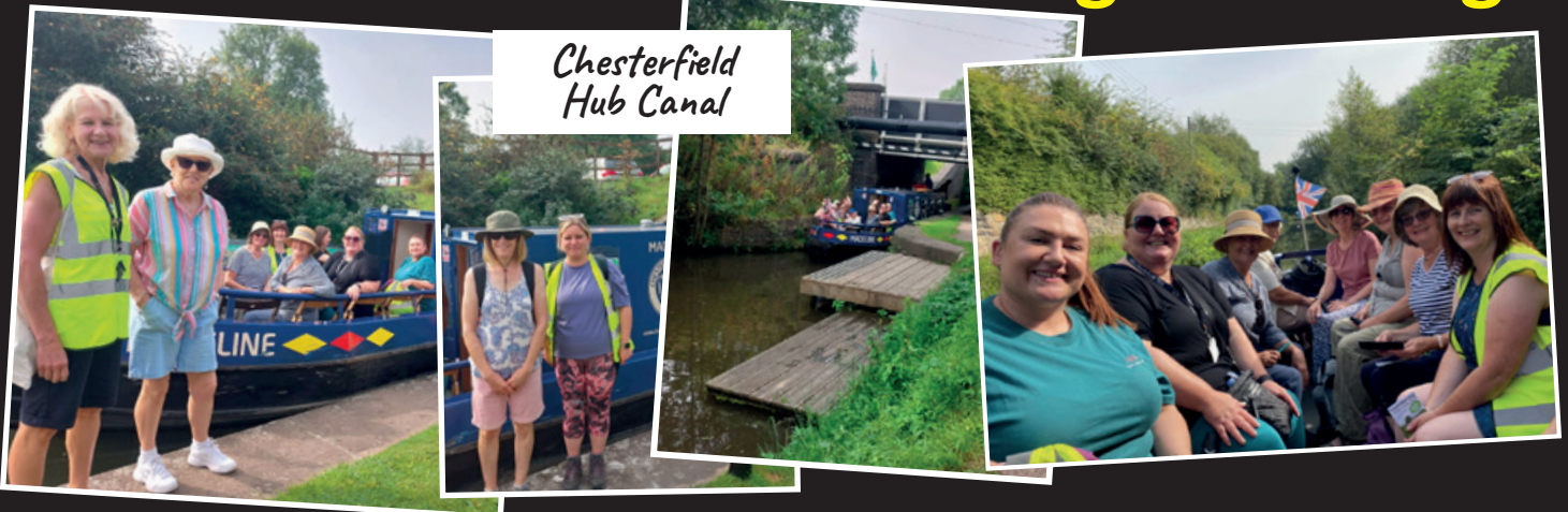
Chesterfield Hub Canal