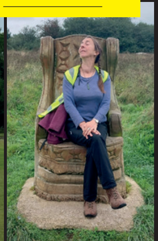
Tea, sign and chat Alfreton Park